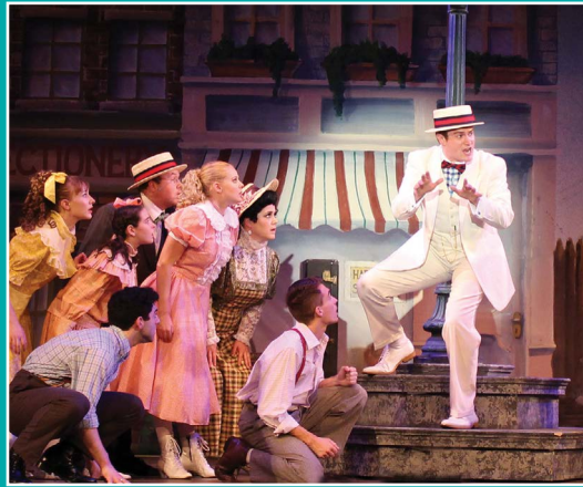
Broadway Palm Theater