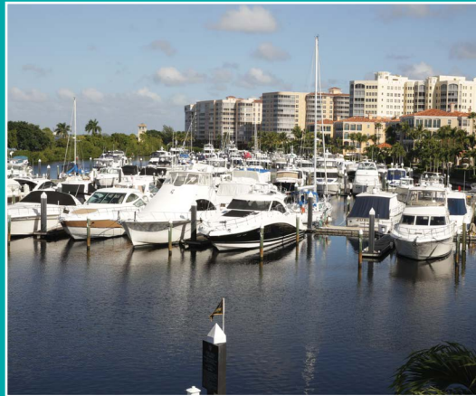
Gulf Harbour Yacht & Country Club