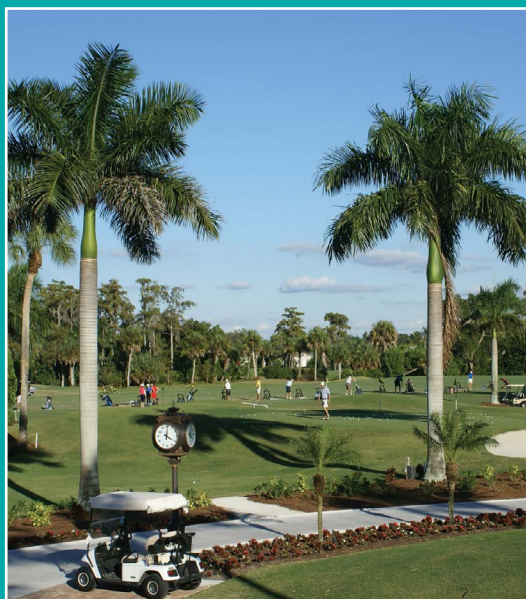
Cypress Lake Country Club