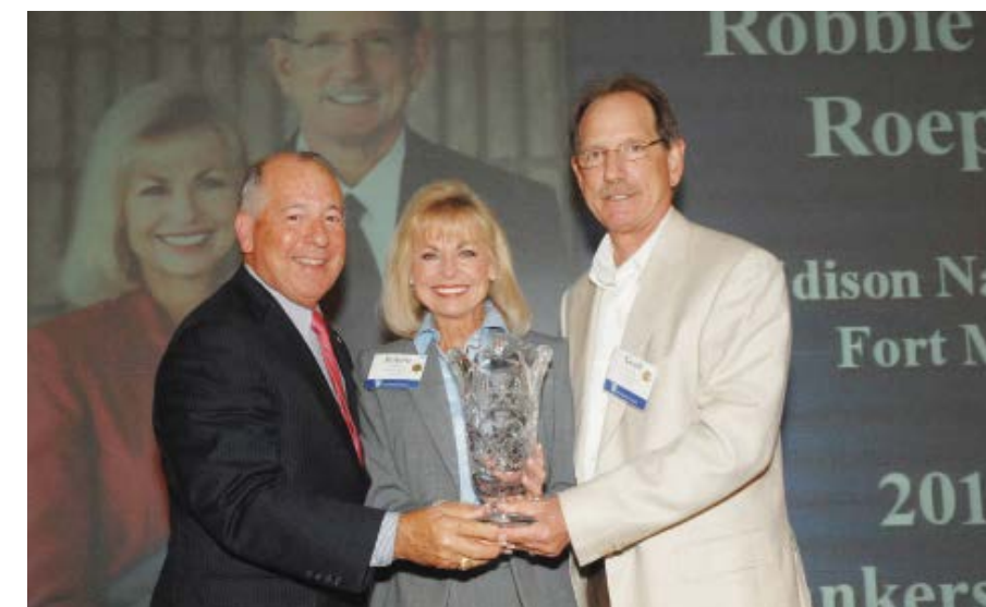
BANK OF THE ISLANDS