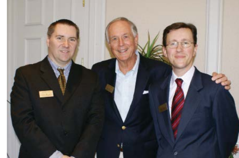
SANIBEL CAPTIVA TRUST COMPANY

BANK OF THE ISLANDS BIG ARTS CROW "DING" DARLING CAPTIVA YACHT CLUB CONSERVATION FOUNDATION F.I.S.H. HEALTHPARK OF THE ISLANDS ISLAND SENIORS JOHN R. WOOD PREMIER SOTHEBY'S ROTARY CLUB SANCTUARY GOLF CLUB SANIBEL COMMUNITY CHURCH SANIBEL CAPTIVA TRUST COMPANY SANIBEL CAPTIVA NEIGHBORS CLUB SANIBEL COMMUNITY HOUSE SANIBEL RECREATION COMPLEX STRAUSS THEATER THE DUNES GOLF & TENNIS CLUB THREE CRAFTY LADIES VIP REALTY GROUP