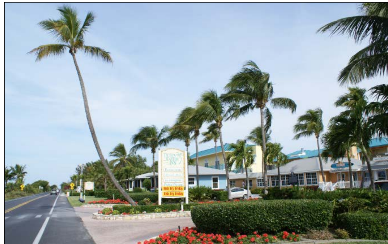
'TWEEN WATERS INN

ALL STAR VACATIONS ISLAND VACATIONS SANIBEL HOLIDAY AMERICAN REALTY JENSEN'S ON THE GULF SANIBEL MOORINGS ANCHOR INN KINGFISHER RENTALS SANIBEL SIESTA BEACHVIEW COTTAGES KONA KAI SBL SANIBEL VACATIONS BLUE DOLPHIN LIGHTHOUSE RESORT SEASHELLS OF SANIBEL CAPTIVA ISLAND INN MITCHELL'S SANDCASTLES SELECT VACATIONS CARIBE OCEAN'S REACH SHALIMAR CASA YBEL RESORT PELICAN'S ROOST SHELL ISLAND BEACH COLONY RESORT ROYAL SHELL VACATIONS SURFRIDER FORTY-FIFTEEN SANDY BEND TORTUGA BEACH CLUB HILTON GRAND VACA- TIONS SANIBEL ARMS 'TWEEN WATERS INN HURRICANE HOUSE SANIBEL BEACH CLUB TWIN PALMS RESORT ISLAND INN SANIBEL BEACH CLUB II VIP VACATION RENTALS SANIBEL COTTAGES WATERSIDE INN