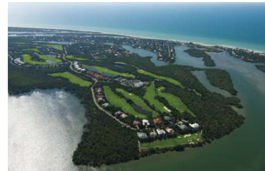
THE SANCTUARY GOLF CLUB