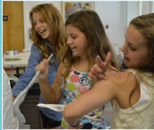
Marco Island Center for the Arts