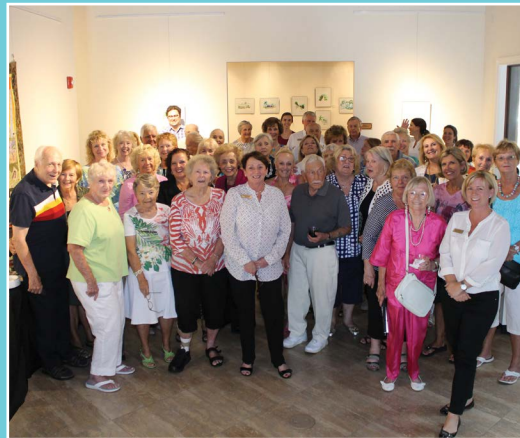
Marco Island Historical Society